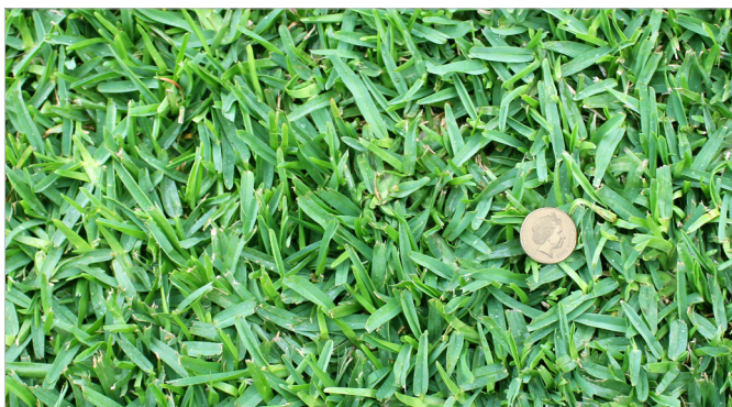
Fig 2. $2 coin on wide shot of grassed area